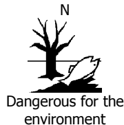
Dangerous for the environment